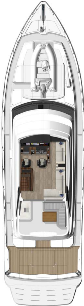
Optional tender and davit