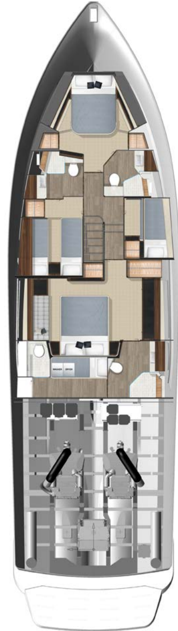
Optional crew design