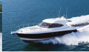
2007 - 4700 Sport Yacht