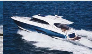
2016 - 5400 Sport Yacht