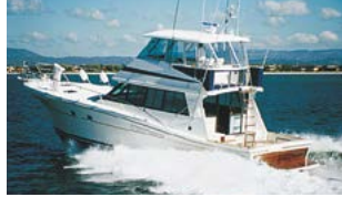
1988 - 52 Enclosed Flybridge