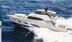
2018 - 72 Sports Motor Yacht