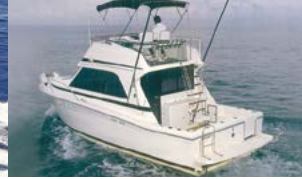
1995 - 3300 Open Flybridge