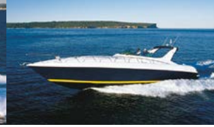
2001 - M430 Sport Cruiser