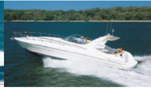
2007 - M470 Sport Cruiser