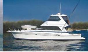
1993 - 48 Enclosed Flybridge SI