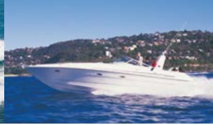
1987 - 34 Diavalo