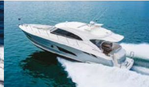
2016 - 4800 Sport Yacht