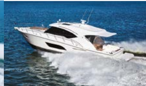
2016 - 575 SUV