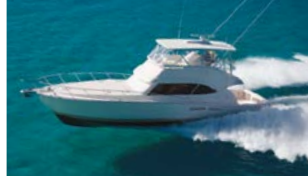
2008 - 56 Open Flybridge