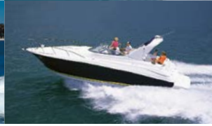
2002 - M370 Sport Cruiser