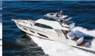
2017 - 68 Sports Motor Yacht