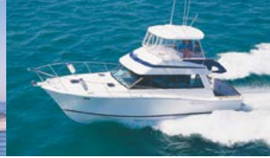
1986 - 38 Open Flybridge MK II