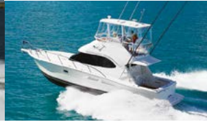
2008 - 38 Open Flybridge