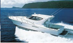
1997 - 4000 Offshore Enclosed