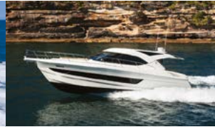
2011 - 4400 Sport Yacht SII