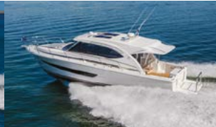
2018 - 395 SUV