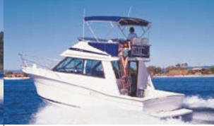
1987 - 33 Open Flybridge