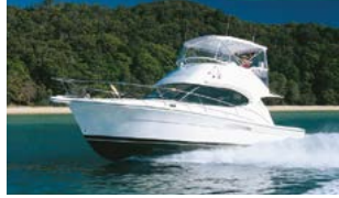
2004 - 33 Open Flybridge