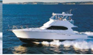
2002 - 47 Open Flybridge SI