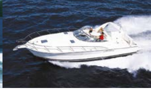
1997 - 4000 Offshore Open