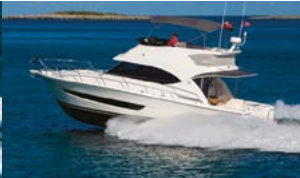
2018 - 39 Sports Motor Yacht