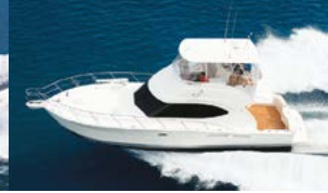
2007 - 45 Open Flybridge