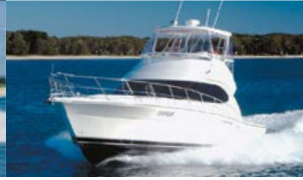
2003 - 42 Open Flybridge