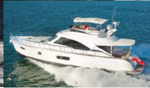
2012 - Belize 54 Daybridge