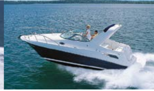
2002 - M290 Sport Cruiser