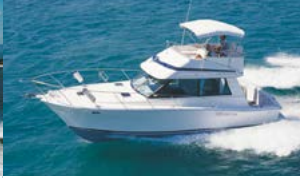
1987 - 35 Open Flybridge