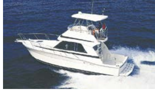
1997 - 34 Open Flybridge