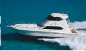
2008 - 51 Enclosed Flybridge SII