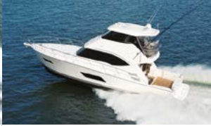
2013 - 50 Enclosed Flybridge