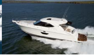
2008 - 4400 Sport Yacht