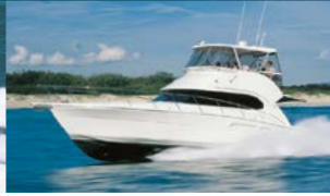
2003 - 47 Open Flybridge SII