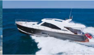
2011 - Belize 54 Sedan