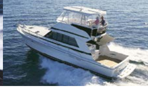
1996 - 43 Open Flybridge