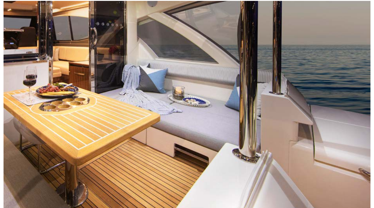
Mezzanine daybed lowered

And the fixed lounges mean there is no need to dig out occasional furniture for the mezzanine – it's all weather and always ready for company. Relaxing and entertaining on the mezzanine has never been easier - one of the many outstanding design features that have added a new dimension to the 505 SUV.