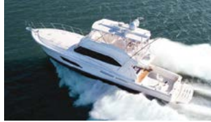
2013 - 63 Open Flybridge