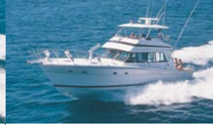
1985 - 52 Open Flybridge