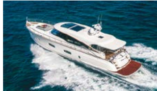
2018 - Belize 66 Sedan