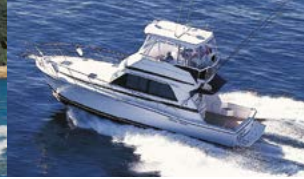
1996 - 39 Open Flybridge