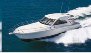
2008 - 48 Offshore Express