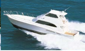
2003 - 58 Enclosed Flybridge