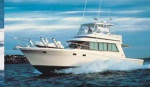
1985 - 46 Open Flybridge