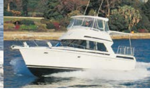
1996 - 40 Open Flybridge Aft Cab