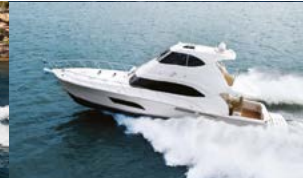
2011 - 61 Enclosed Flybridge SII