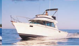
1987 - 27 Open Flybridge