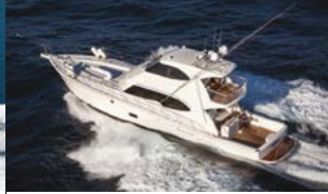
2012 - 75 Enclosed Flybridge