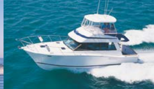
1986 - 38 Open Flybridge MK II