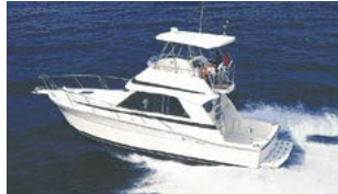
1997 - 34 Open Flybridge