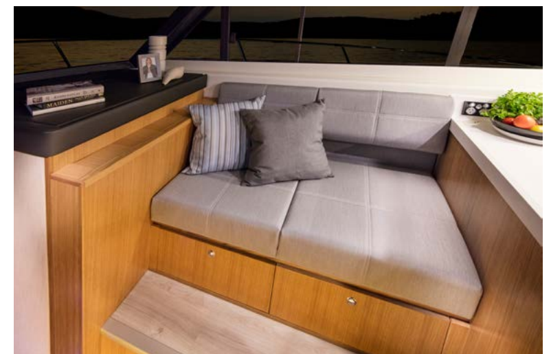
Satin Oak timber finish