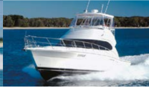
2003 - 42 Open Flybridge