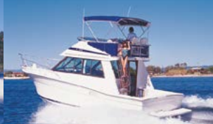
1987 - 33 Open Flybridge