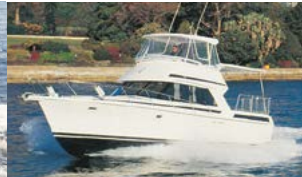
1996 - 40 Open Flybridge Aft Cab