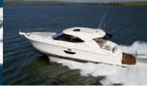
2008 - 4400 Sport Yacht