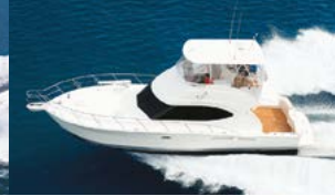
2007 - 45 Open Flybridge