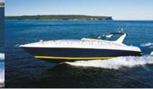
2001 - M430 Sport Cruiser