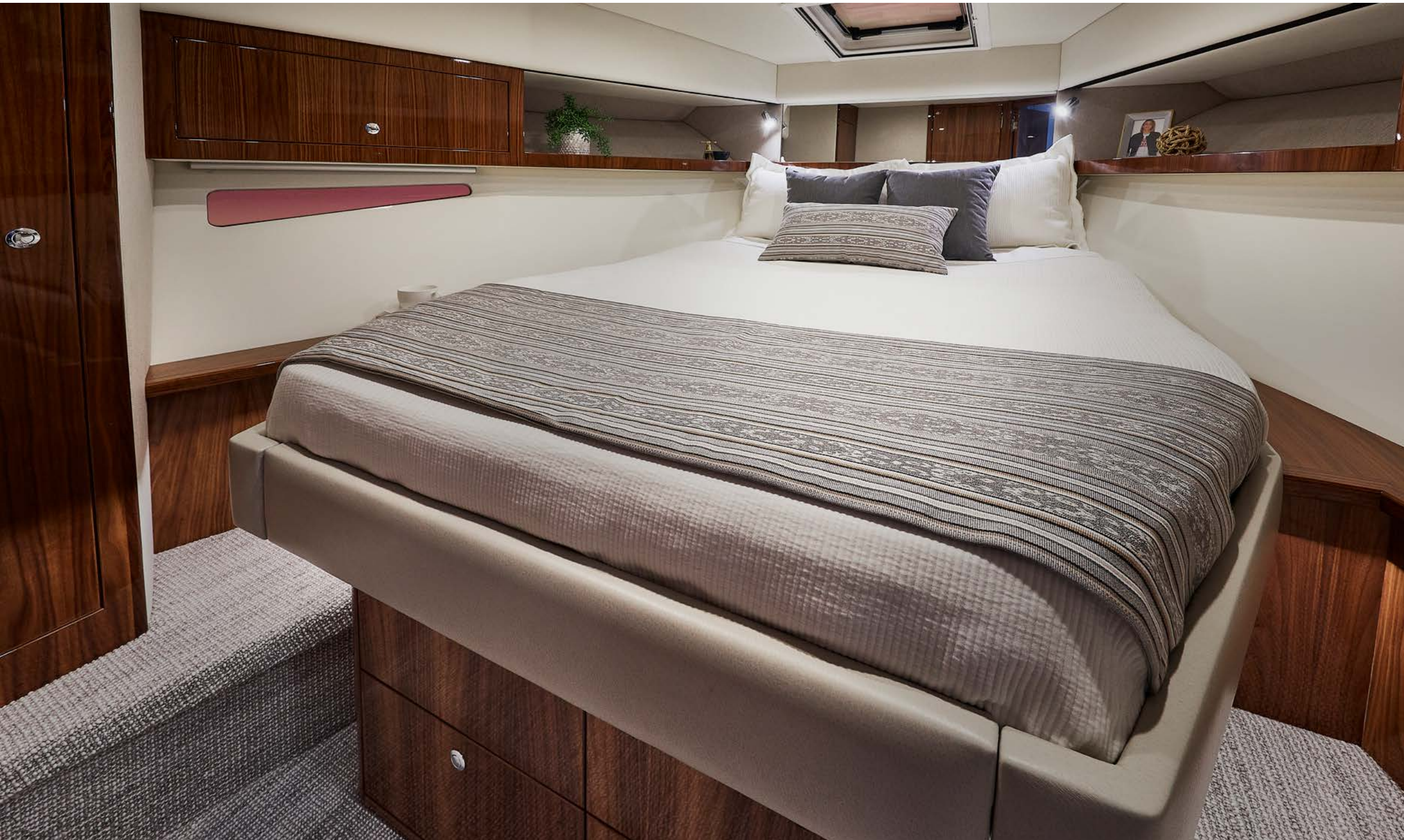
Gloss Walnut timber finish