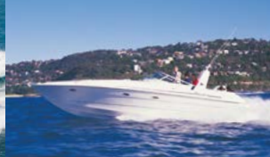
1987 - 34 Diavalo