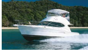
2004 - 33 Open Flybridge