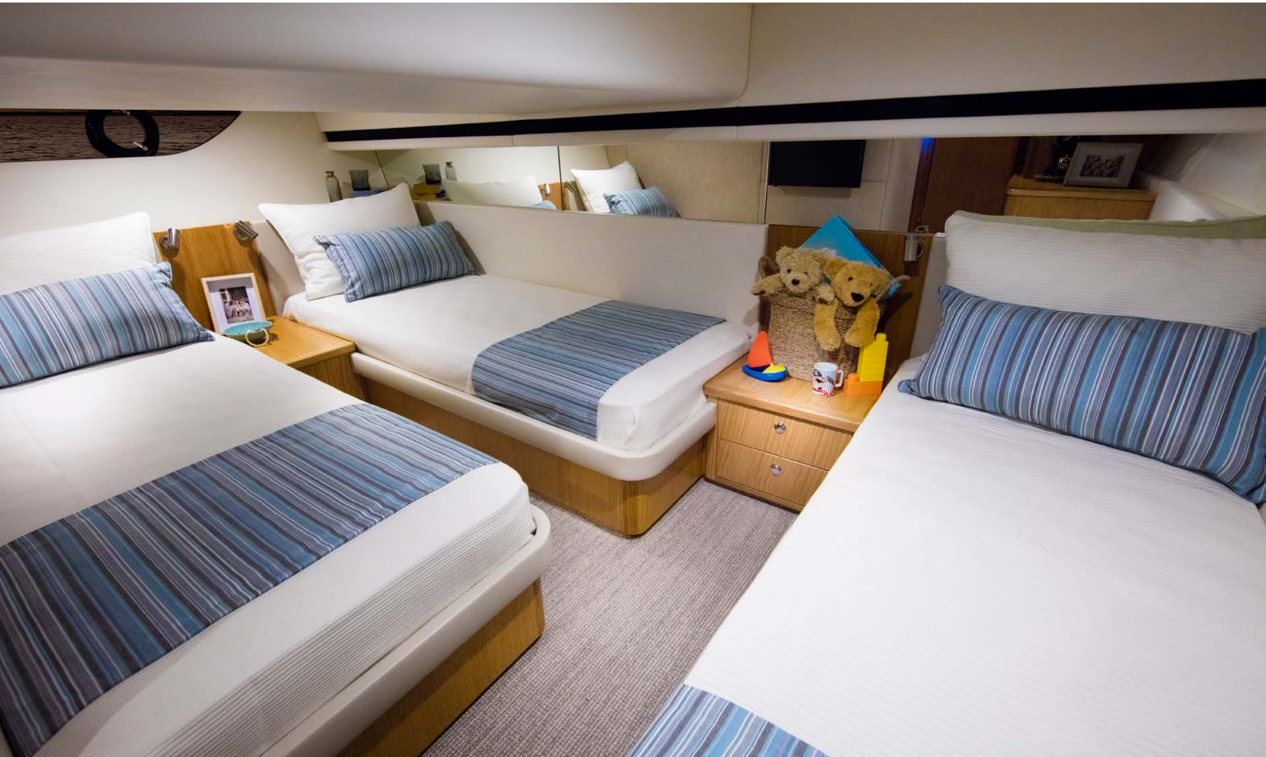
Satin Oak timber finish