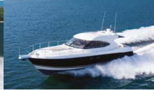
2007 - 4700 Sport Yacht