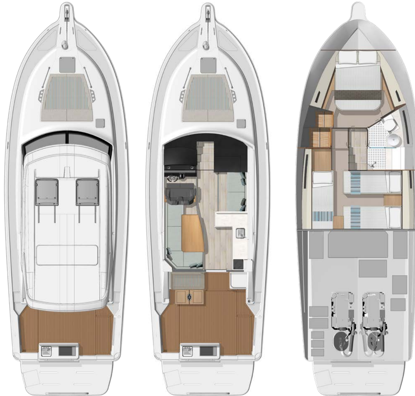
Optional cockpit teak deck shown