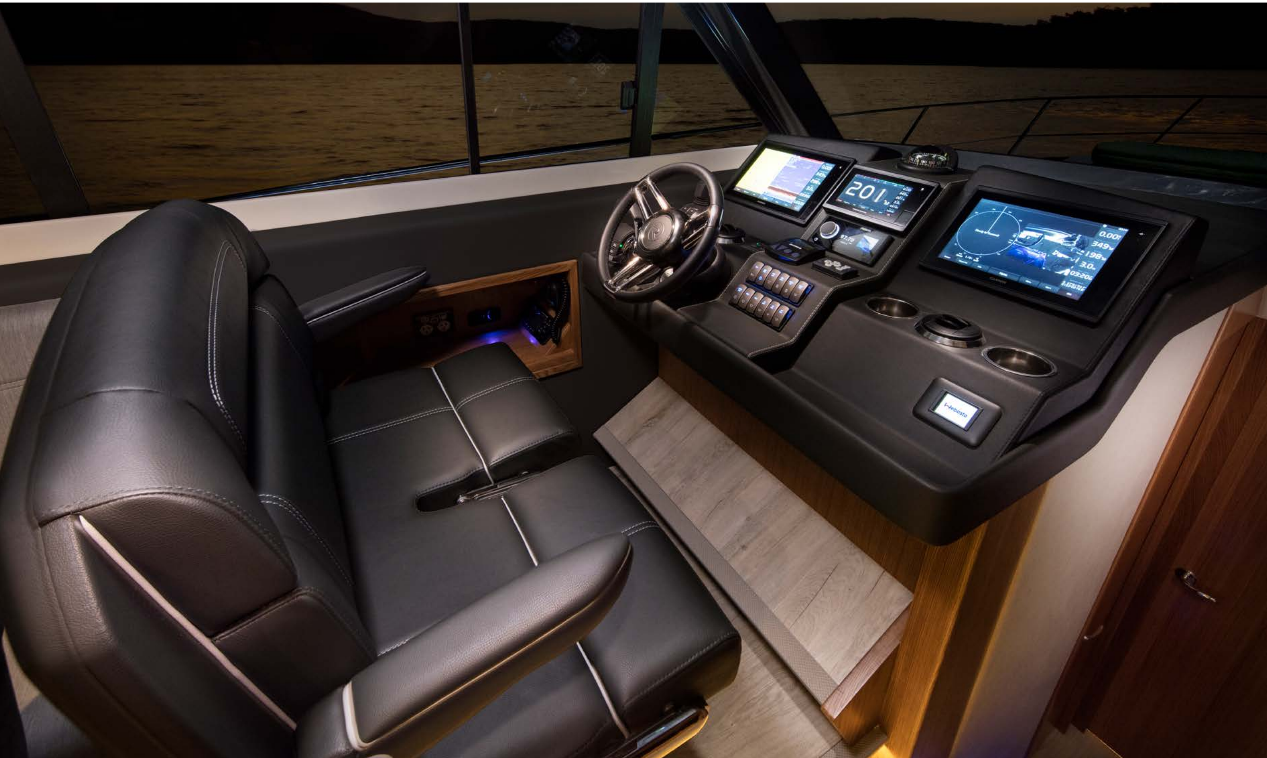
Satin Oak timber finish