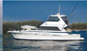
1993 - 48 Enclosed Flybridge SI