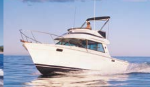
1987 - 27 Open Flybridge