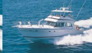
1985 - 52 Open Flybridge