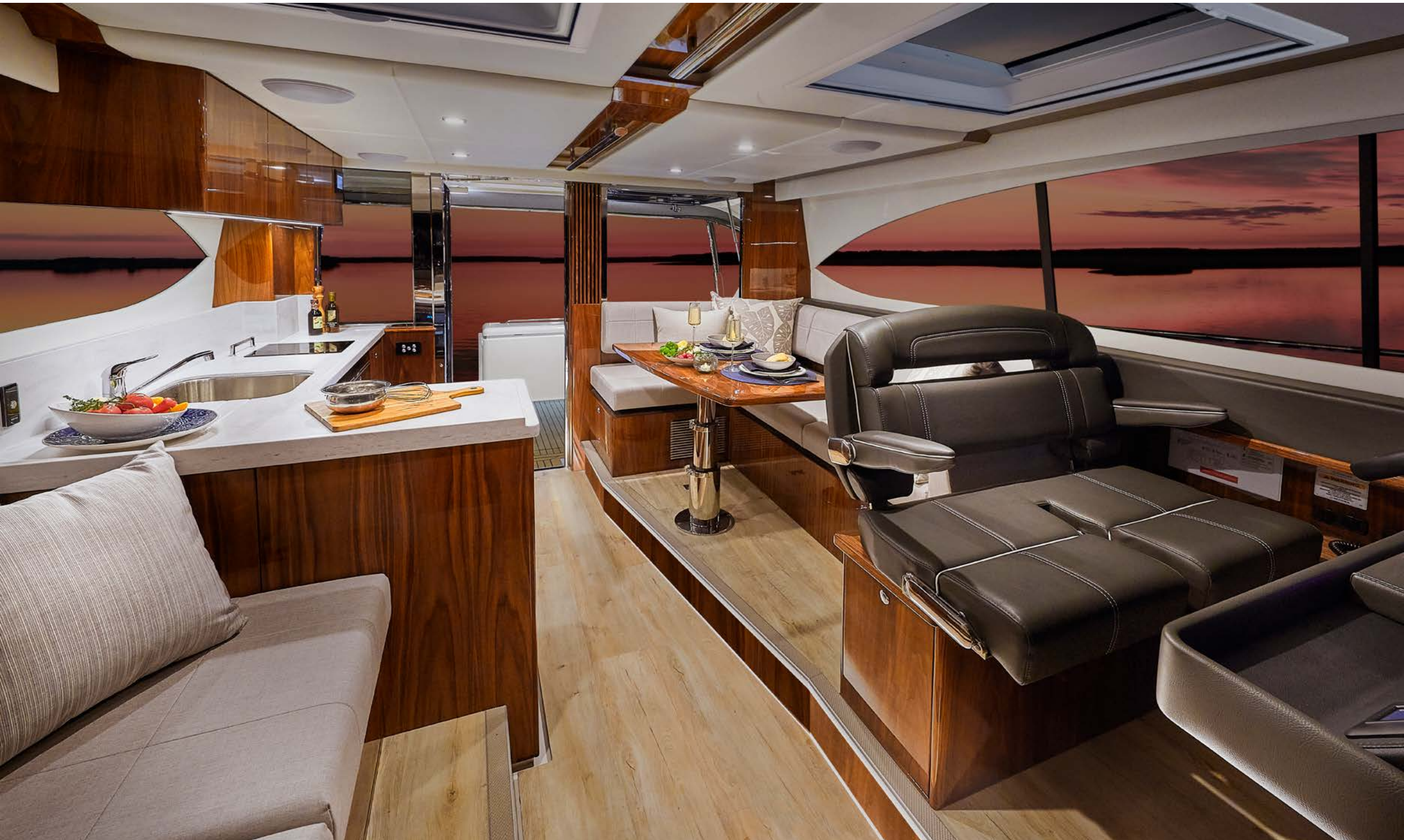
Gloss Walnut timber finish