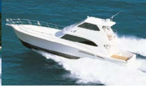
2003 - 58 Enclosed Flybridge