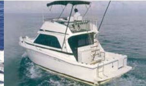
1995 - 3300 Open Flybridge