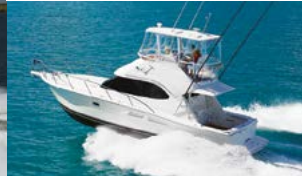
2008 - 38 Open Flybridge