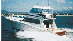
1988 - 52 Enclosed Flybridge