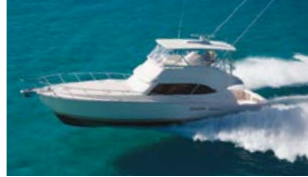
2008 - 56 Open Flybridge