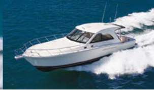
2008 - 48 Offshore Express