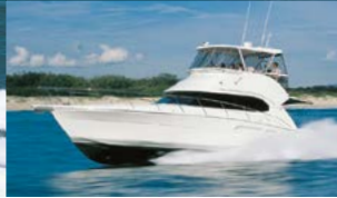
2003 - 47 Open Flybridge SII