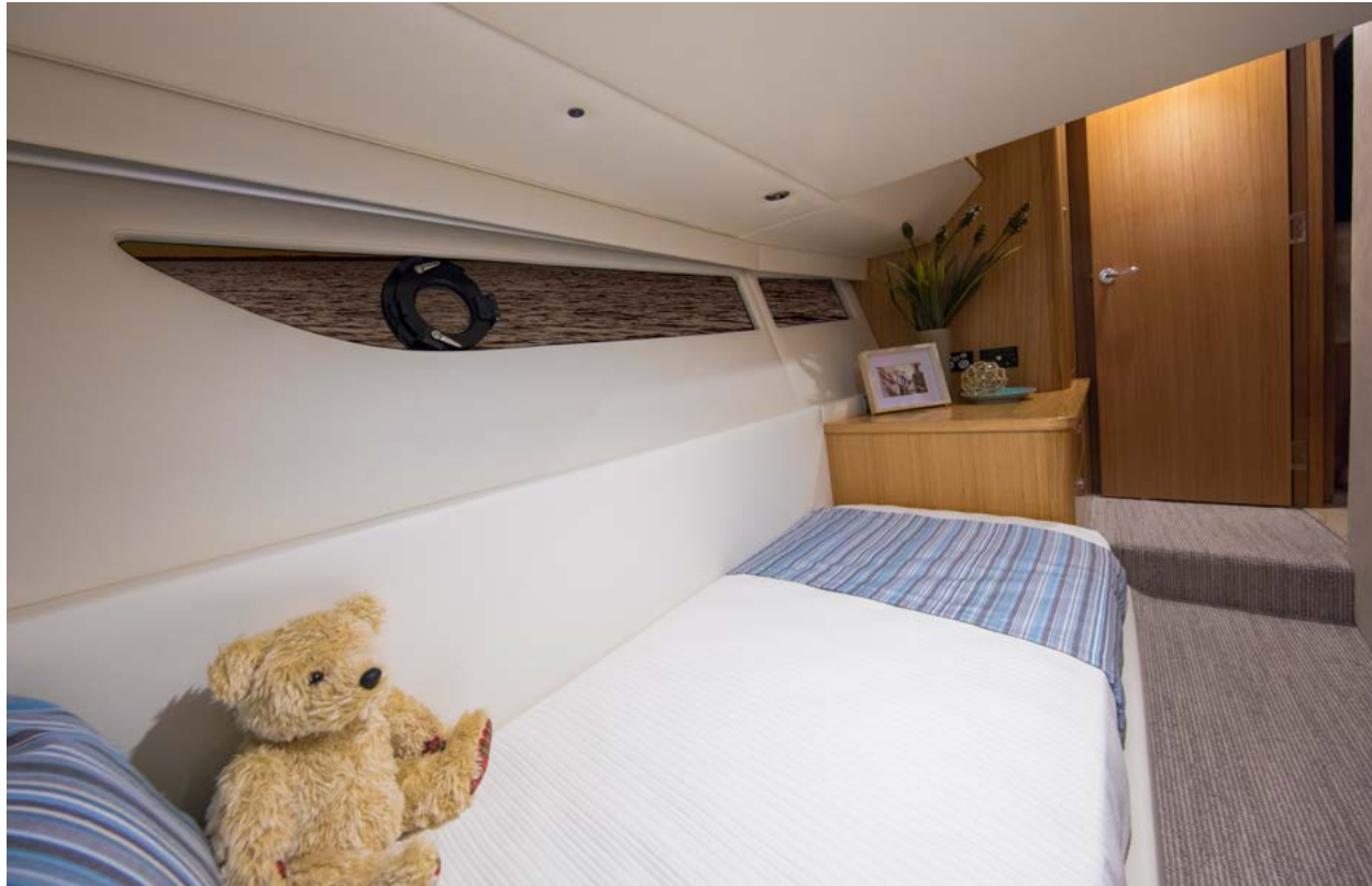
Satin Oak timber finish