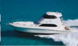
2008 - 51 Enclosed Flybridge SII