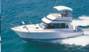
1987 - 35 Open Flybridge