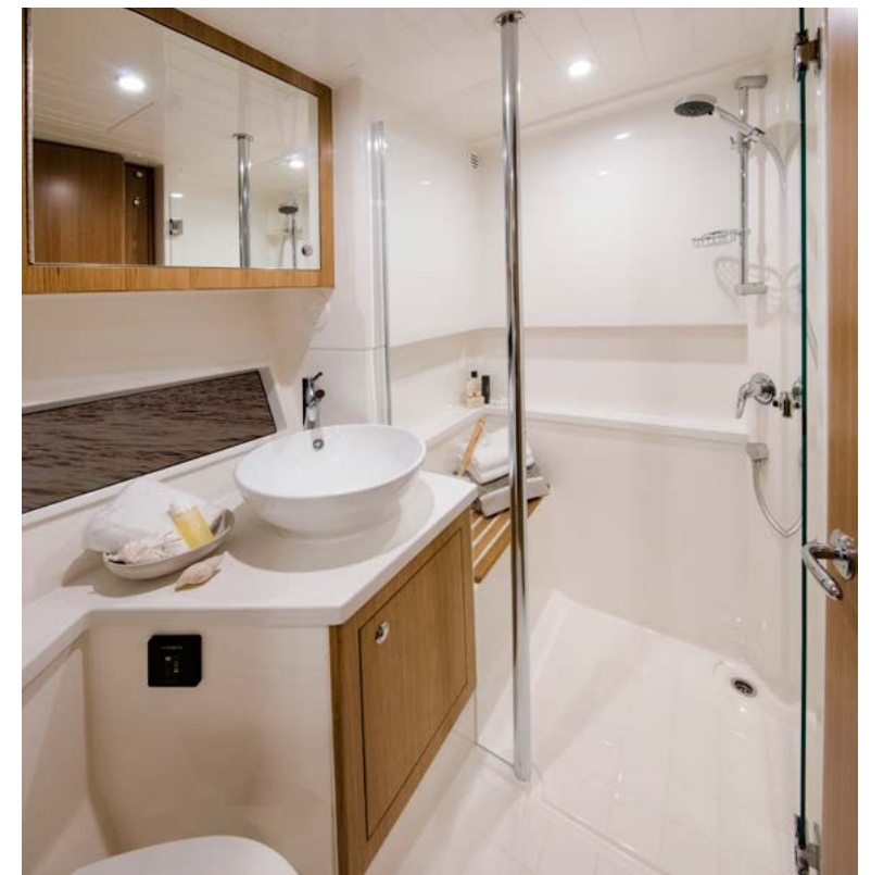
Satin Oak timber finish