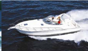
1997 - 4000 Offshore Open