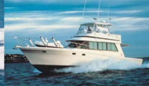
1985 - 46 Open Flybridge