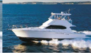
2002 - 47 Open Flybridge SI