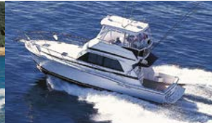
1996 - 39 Open Flybridge