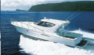
1997 - 4000 Offshore Enclosed