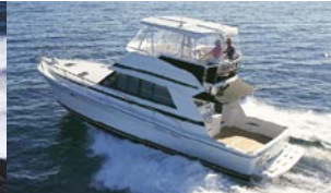
1996 - 43 Open Flybridge