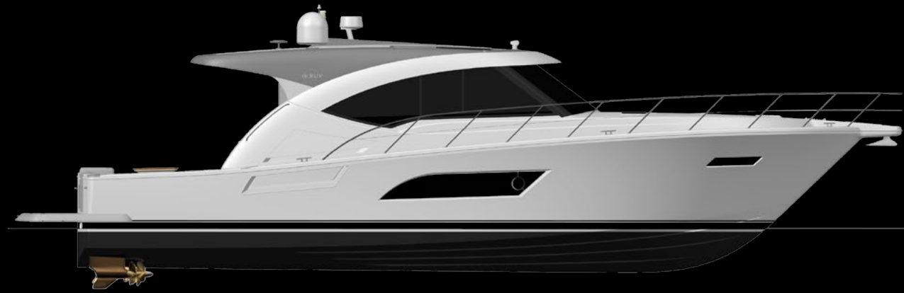
OPTIONAL HYDRAULIC SWIM PLATFORM

Each country and State has different safety equipment standards. It is important that you ensure the requirements in your jurisdiction are met prior to the vessel being used.